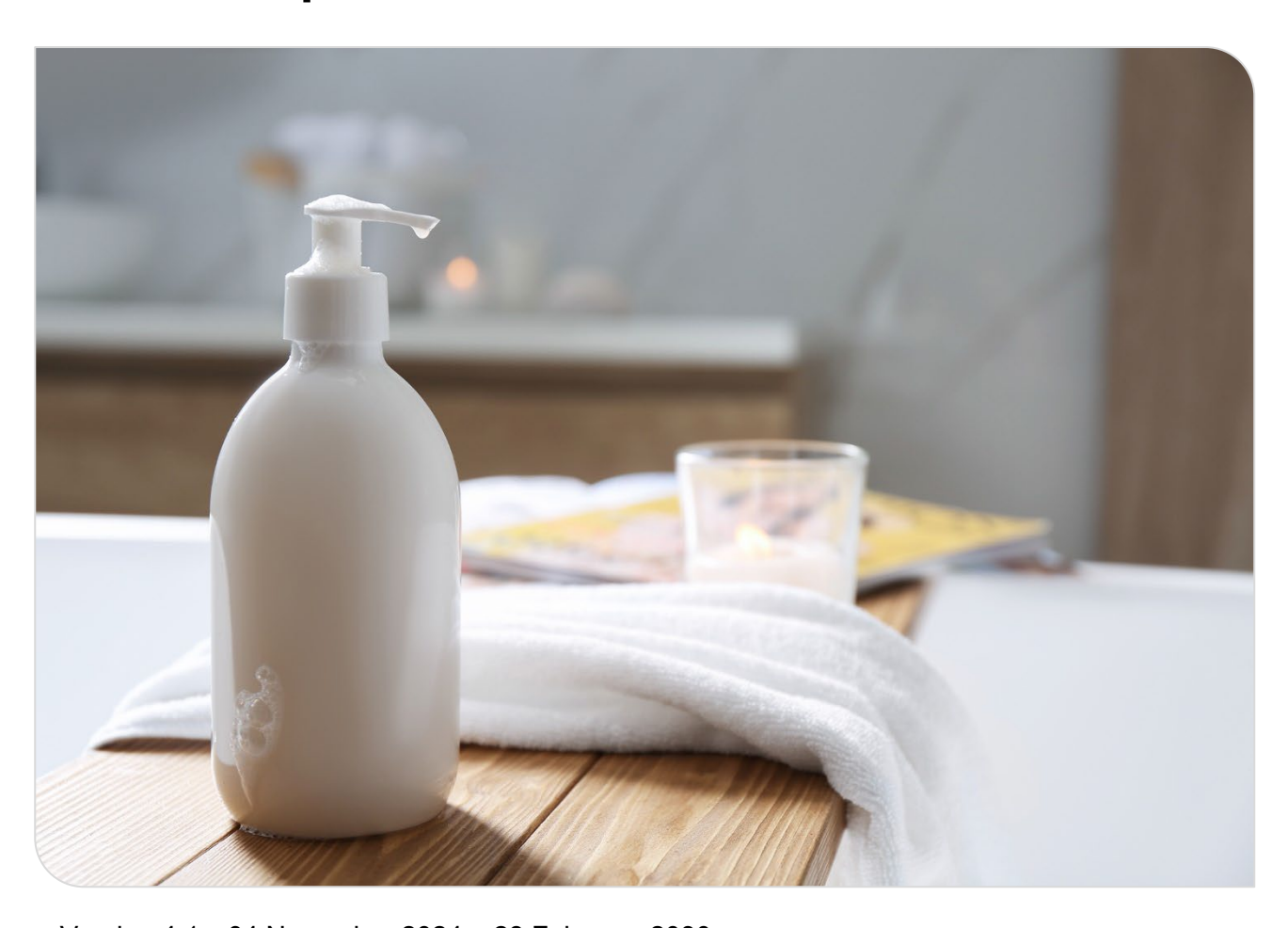
Version 4.1 • 04 November 2024 – 28 February 2030